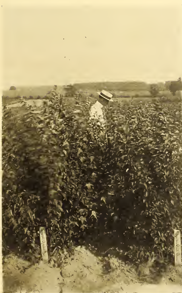
Two Year Spireas